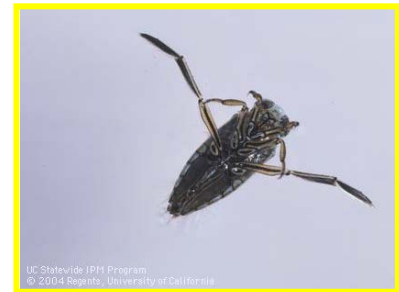
Backswimmer Insect, a mosquito predator

Water will attract adult mosquitoes, but trying to control the adults or prevent them from laying eggs is difficult. It is a lot easier to manage the larvae, since they are concentrated in known areas, they don't yet bite, and they can't fly away. If you are constructing a pond, keep in mind that mosquito larvae prefer shallow water that is less than 24 inches deep. Ponds or features with steep slopes, or vertical walls that quickly drop off into deep water are less favorable to