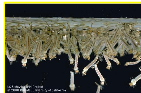
Mosquito larvae just under the surface of the water