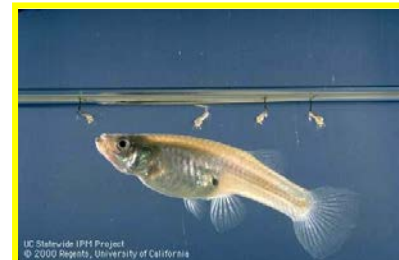
Mosquito fish eats mosquito larva