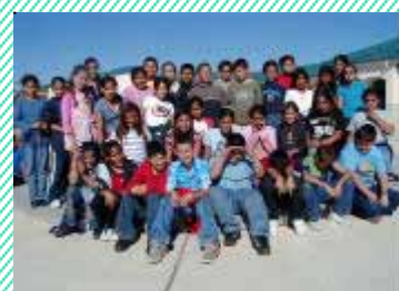
Walkers from Frank Ledesma School