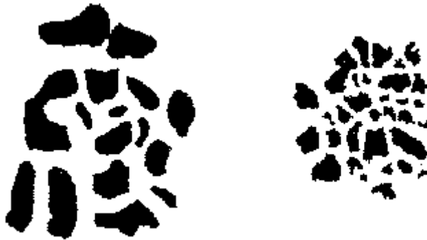
Fig. 1. Sclerotia of Sclerotinia sclerotiorum (left) and S. minor (right).

The most obvious and typical initial symptom of S. sclerotiorum or S. minor is the presence of a cottony, white, dense mat of mycelial growth (mass of fungus strands) on the surface of the host and on the adjacent soil surface. Within this fluffy white mass, dense white bodies of fungus soon form. These bodies become black and hard as they mature and are called sclerotia (pl) (sclair-o-she-ah). A single body is called a sclerotium (sclair-o-she-um) . The sclerotia act like seeds and allow the fungus to survive for several years in the soil. S. sclerotiorum produces large (2-10 mm in diameter), smooth, rounded sclerotia, while S. minor produces small (0.5-2 mm in diameter), rough, angular sclerotia (Fig. 1).