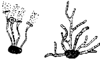
Fig. 2. S. minor sclerotia usually germinate by producing a mass of fungal threads (right). S. sclerotiorum can produce spores from small mushrooms (left) or germinate directly similar to S. minor (right).

Sclerotinia minor seldom produces spores (Fig. 2). This pathogen usually attacks the lettuce stem at or near the soil line. Lesions develop on the stem, and the pathogen gradually “cuts” the plant in two at which time the head collapses or “drops.”