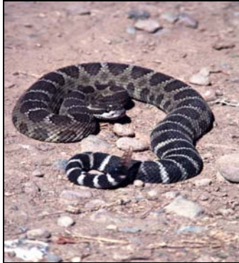
Southern Pacific Rattlesnake