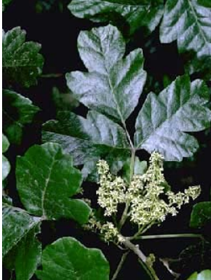
Western Poison Oak

Toxic plants can cause mild to severe dermatitis or other reactions when plant sap, fluids, or thorns come into contact with exposed skin or other tissues. California toxic plants include weeping fig, poison oak, chrysanthemum, geranium, ivy, century plant, crown of thorns, primrose, and firethorn.