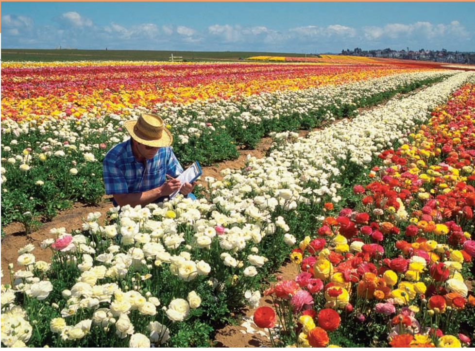
Effective integrated pest management (IPM) is based on regular monitoring and good record keeping. Above, an IPM scout inspects plants for disease. Right, "The Integrated Control Concept," a seminal article published in the October 1959 Hilgardia , provided the foundation for modern IPM.